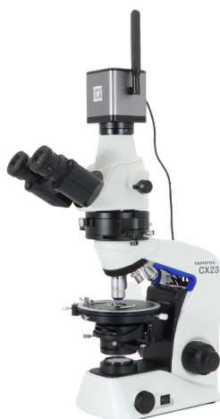
Configured with Multi-output Camera