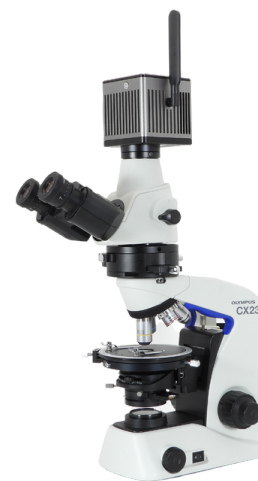
Configured with Smart Camera