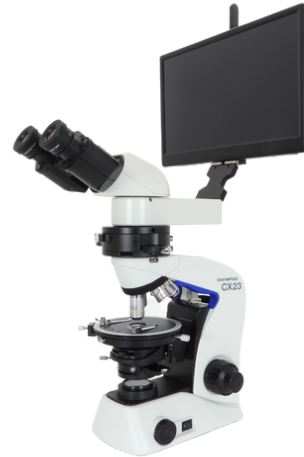
Configured with All-in-one Embedded Smart Camera