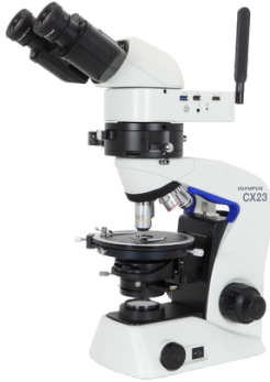
Configured with Embedded Smart Camera